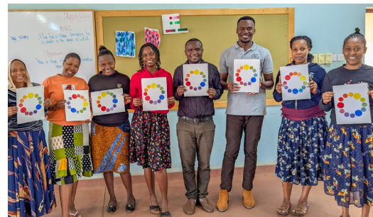
RICE students displaying the color wheels they made