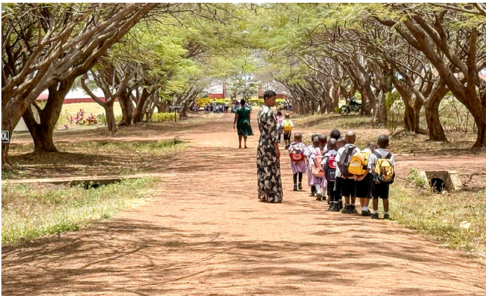
End of the school day