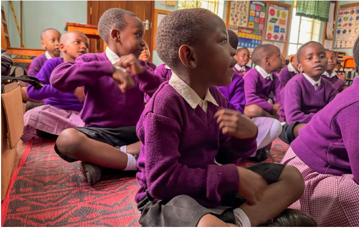
EC3 Students doing opening exercises

Our school has been blessed with 408 students this year (three-year-olds to eleventh grade...Tanzanian schools only go to eleventh grade). This is an increase of about twenty percent in the three years we have been in Tanzania. When we interview parents of prospective students, we always ask what they have heard about Rafiki. The answer always comes back as good academics and students being transformed in a good way. We are so thankful to hear this. We explain that our daily Bible study is a major contributor and also our use of classical pedagogy encourages students to think for themselves which gives them a confidence their peers in other schools do not develop. Grades two, four, nine, and eleven are preparing for national exams in October and November. We thank God for past success and look forward to another good year.