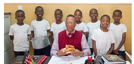
Fourth graders bring fresh mandazi to the Headmaster