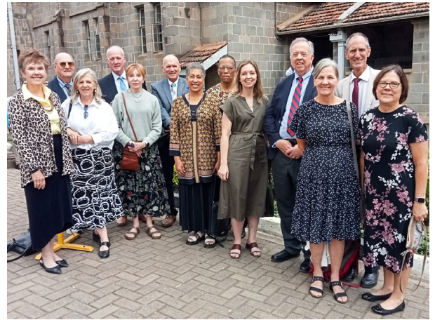
Home Office staff